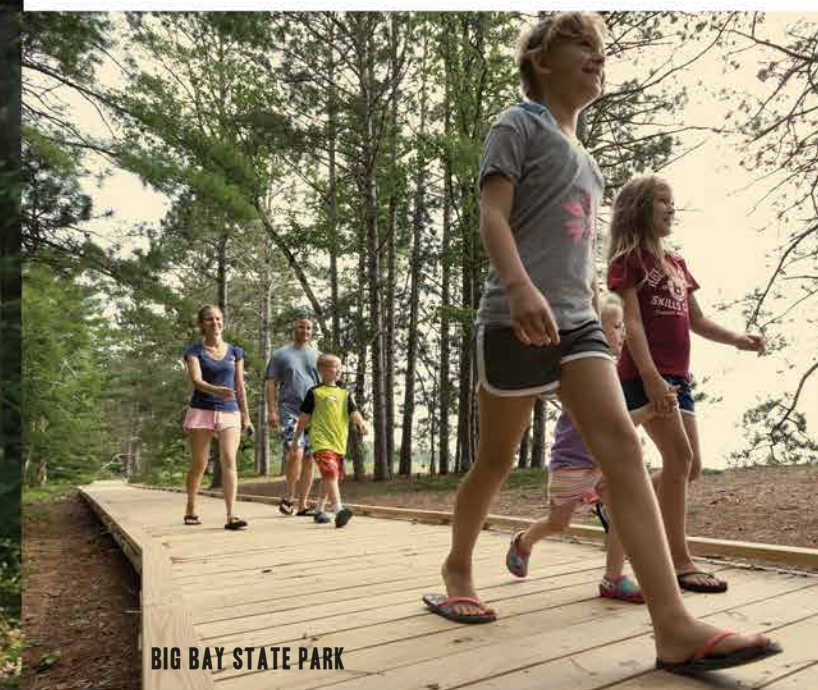
BIG BAY STATE PARK