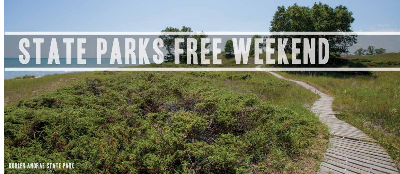
KOHLER ANDRAE STATE PARK

Celebrate the multicultural heritage of "Sawdust City" with five days of music, food, parades and the largest Fourth of July fireworks display in the Fox Valley. 920-235-5584 www.sawdustdays.com