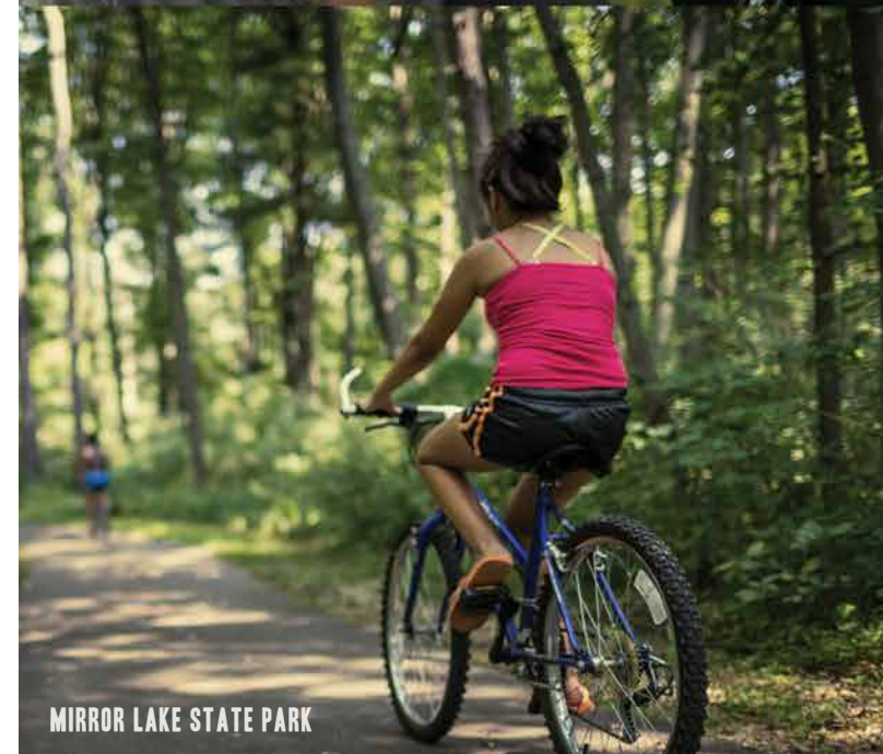
MIRROR LAKE STATE PARK