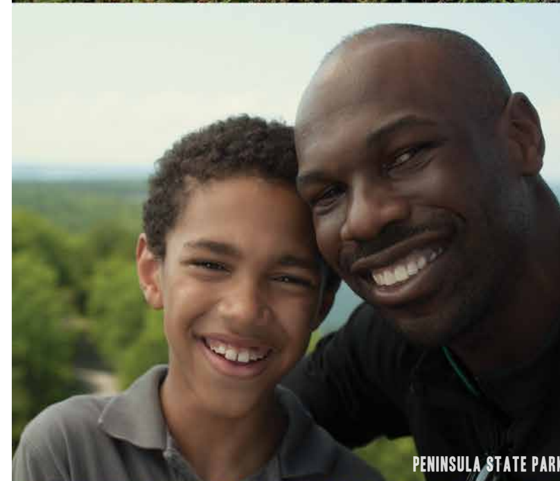
PENINSULA STATE PARK