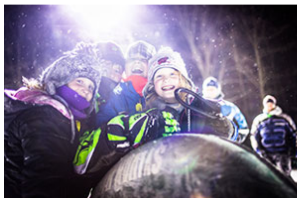
Kids snow tubing, photo courtesy of TravelWisconsin.com

Feeling too uncoordinated for snowboarding? Then snow tubing is your answer. Sit in the comfort of your tube downhill and then let the magic carpet whisk you back to the top. It's for all ages and abilities with no experience required. Pick up a tube at the "World's Largest Tubing Park," Sunburst Winter Sports Park in Kewaskum. Sunburst's snow making equipment means their 42 chutes are always ready to go. At Wilmot Mountain in Wilmont, race your way down one of the 1,000-foot-long tubing lanes; the winner gets a hot chocolate at the brand-new lodge.