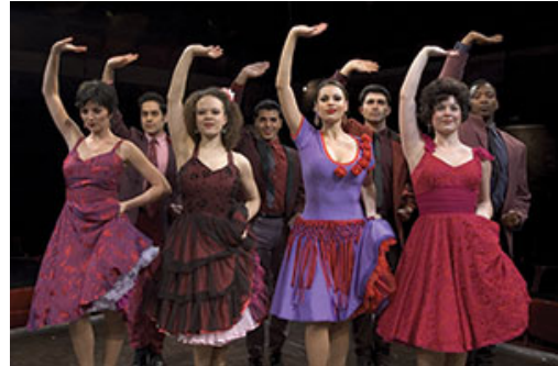
A scene from "West Side Story," photo courtesy of Fireside Dinner Theatre

In the Wisconsin Dells, the new Palace Theater is a state-of-the-art theater destination, producing classic Broadway musicals, as well as bringing to life many Disney classics. A delicious meal is included in the ticket price. Fort Atkinson's Fireside Dinner Theatre offers seven shows annually (plus an award-winning fish fry on Fridays). St. Croix Off Broadway Dinner Theatre in Hudson is presenting the show "Love Letters," just in time for Valentine's Day followed by "Breaking Up is Hard to Do" in March. Seems ironic, huh?