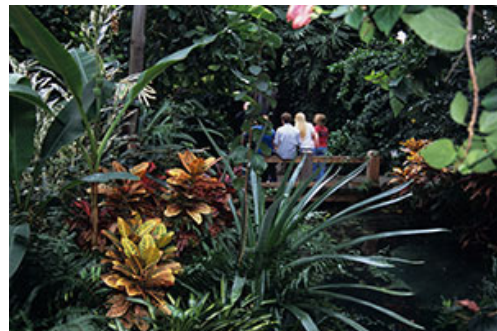
Mitchell Park Conservatory, photo courtesy of TravelWisconsin.com

There's only one place in the world that has the largest concentration of water parks, and it's Wisconsin Dells . This "Waterpark Capital of the World" pumps out over 16 million gallons of water to keep 200 slides in operation. These super-sized indoor waterpark resorts don't just stop at wet rides and slides. Find indoor rope courses, two story Go-Kart trails, 4-D cinemas, arcades, bowling, mini-golf and more. Plus swim up bars, spas and steakhouses make a trip here adult-friendly, too. Three waterpark resorts that offer it all include Chula Vista , Kalahari and the Wilderness Resort .