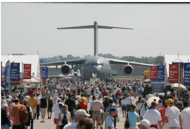
EAA AirVenture.