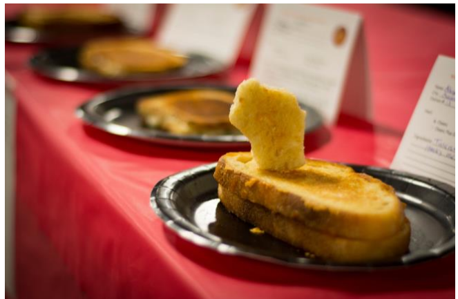
Grilled cheese sandwiches at the Wisconsin Grilled Cheese Championship.