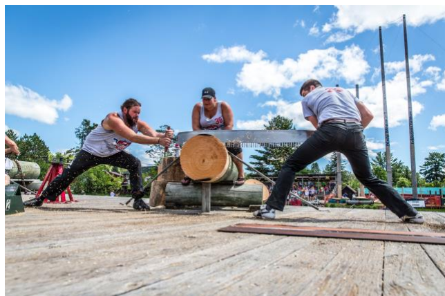
Lumberjack World Championships.