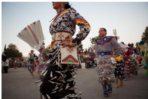
Indian Summer Festival.