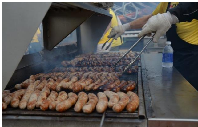
Brats on the grill.